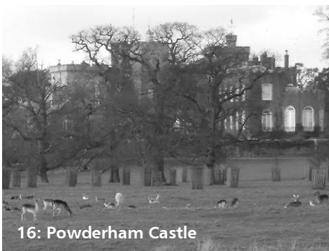
16: Powderham Castle

on the journey. This is called the Parson tunnel, after the rock formation at the other end, the Parson & Clerk rocks, named after characters trapped on the rocks by the Devil, according to local legend.