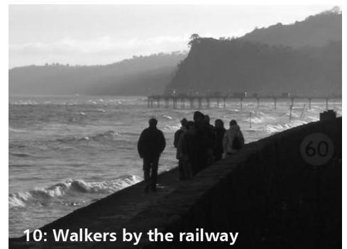
10: Walkers by the railway