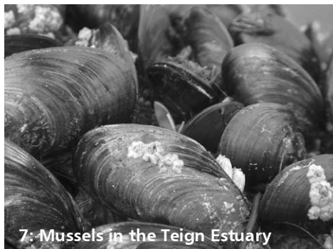
7: Mussels in the Teign Estuary