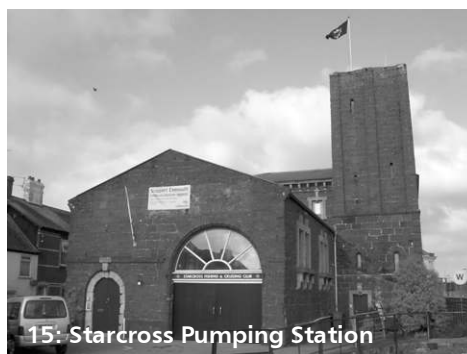
15: Starcross Pumping Station