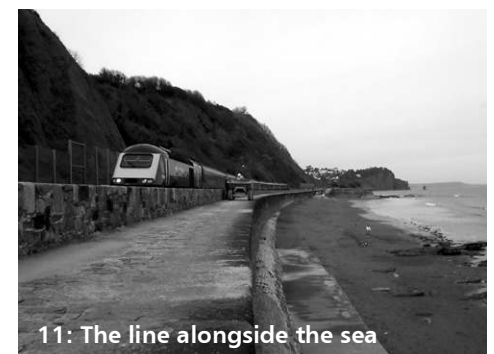
11: The line alongside the sea