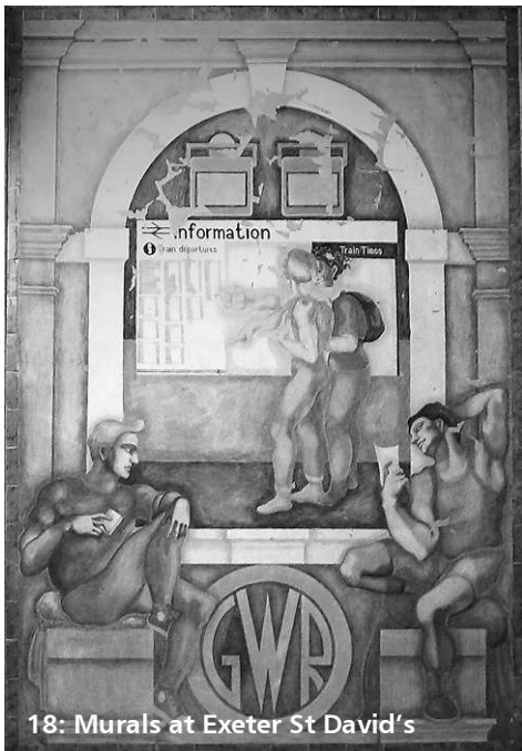
18: Murals at Exeter St David's