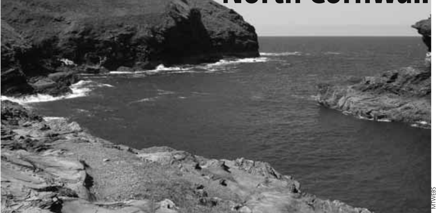
Looking out to sea at Boscastle

Boscastle is a charming Cornish fishing village that seems like a tranquil place to explore on holiday. Don't be fooled: not only can you find witches and wizards in Boscastle, but the village was almost destroyed by extreme weather only a few years ago.