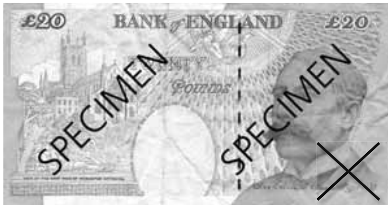
Old £20 notes (above) are being withdrawn. Only new notes (below) will be accepted.