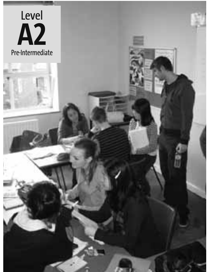
Student's lesson in progress (left) and (above)

the search results aren't relevant to their problem. Other advantages are that the Internet is very fast, easy to operate and it provides a lot of information, which more than half of the students enjoy.