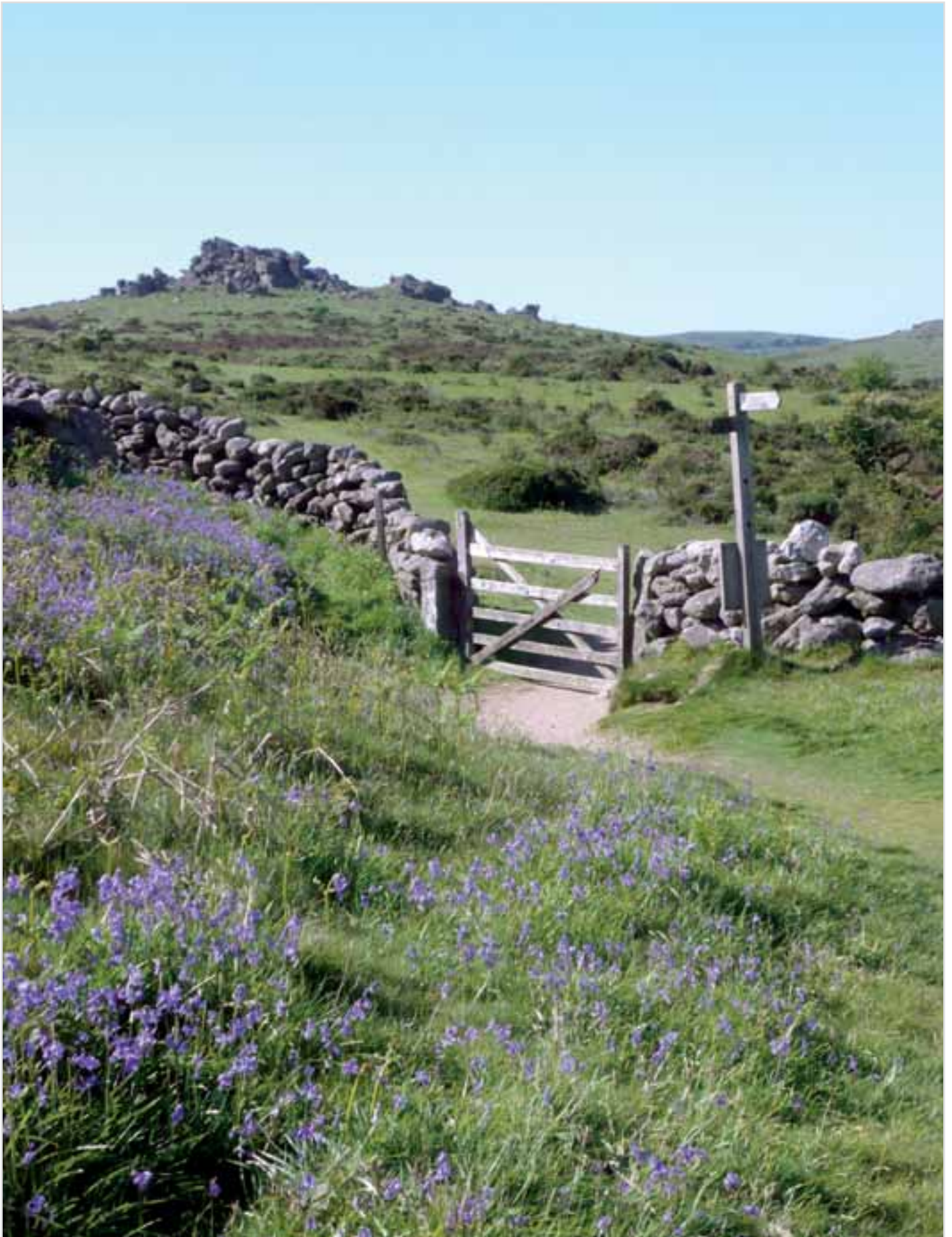
Bluebells close to Hound Tor on Dartmoor.