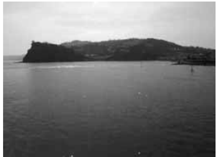
View of the Teignmouth coastline