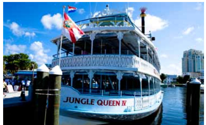
Top: Everglades. Bottom: Jungle Queen river boat.

The Jungle Queen Riverboat offers two different tours; a 3 hour sightseeing cruise that departs every day at 09.30 and 13.30, and a 4-hour dinner cruise that departs every day at 18.00.