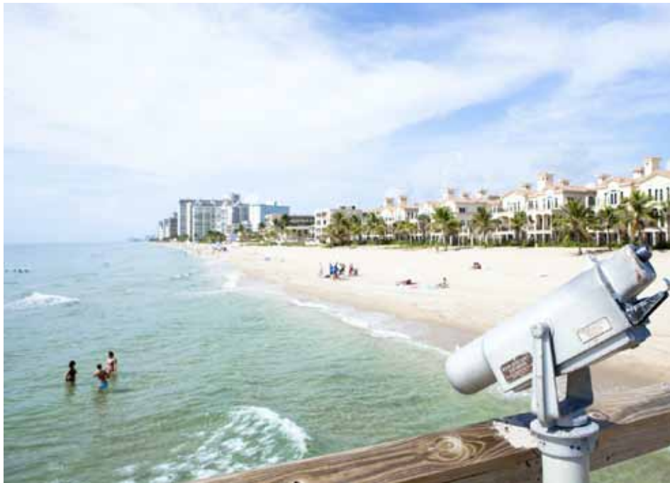
Photographs from top: The beach at Fort lauderdale; Aerial view; Riverwalk.