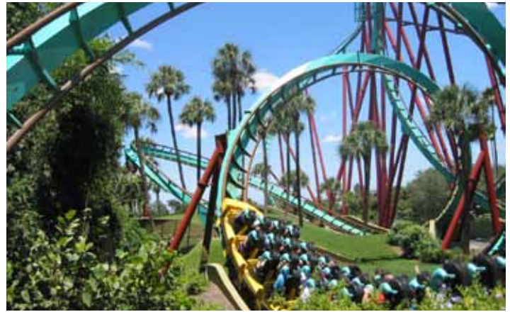
Top: Fort Lauderdale's waterways. Bottom: Busch Gardens