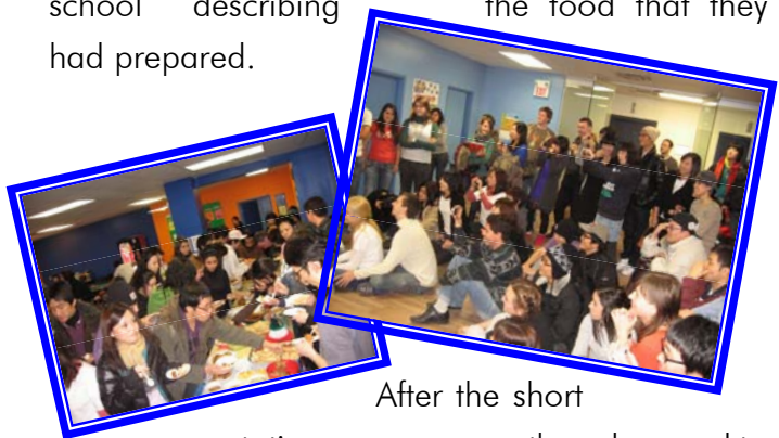
After the short presentations, everyone gathered around to

At SEC we proudly showcase our diversity of cultures within the school. We hosted an international pot luck where each nationality worked together to provide samples of their favourite foods from their home country. The result was a huge success. Each nationality chose a leader to give a short presentation in front of the school describing the food that they had prepared.