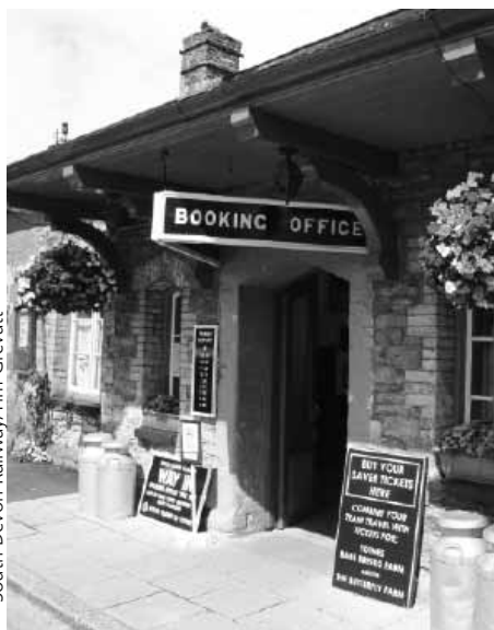
South Devon Railway/Tim Grevatt