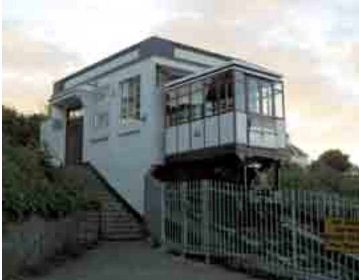
Opposite page: Oddicombe Beach from Babbacombe Promenade. Left: Babbacombe Cliff Railway