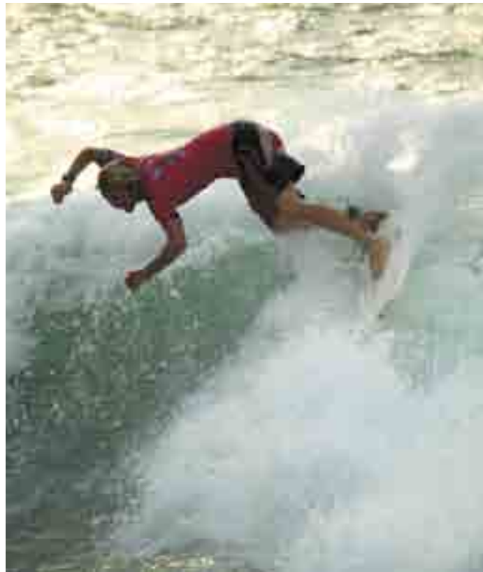
The Westcountry caters for those who like to get their blood pumping on world-class waves as well as those who prefer contemplation on dry land, such as at Glastonbury (below).

The South-west coast has the longest unbroken coastal path in Britain, so it is possible to walk from the fossil-packed, World-Heritage coast of Dorset