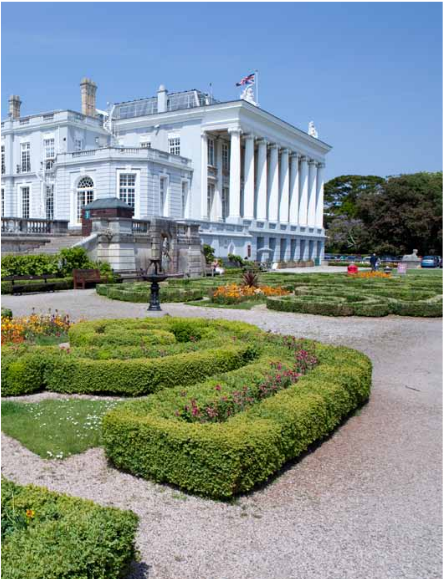
Oldway Mansion in Paignton, built for Isaac Merritt Singer.