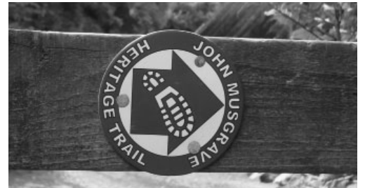
Between Cockington and Totnes the path also follows the John Musgrave trail.