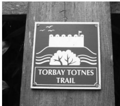
The TTT path is clearly marked with these signs.

The Green Lane becomes a proper road as you reach some houses, and you will soon come to the busy main road to Paignton (12). There is a pedestrian crossing to your left: cross the road here and walk down the hill into Totnes. Cross the bridge and turn right past the Royal Seven Stars. The bus stop for the return to Paignton is opposite the Seven Stars on the bridge side of the road (13).