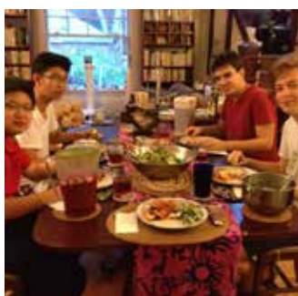
Evening meals are optional