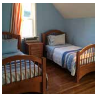
Rooms will vary in size and style