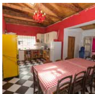
The kitchen and dining area