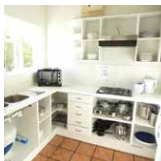
The communal kitchen