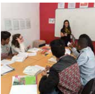
A typical classroom