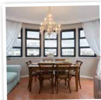
Lounge and dining room