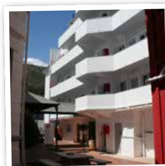
LAL Cape Town residence