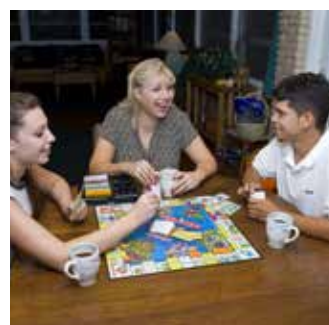
Staying with a host can be fun