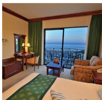
A double bedroom

Bus stops are 5-10 minutes from the hotel. 2-hour ticket €2.00, 7-day ticket €21.00. For more details please visit www.publictransport.com.mt