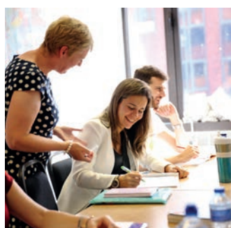
A typical classroom

LAL London | Allied House, 29-39 London Rd, Twickenham, TW1 3SZ