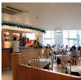
The dining area