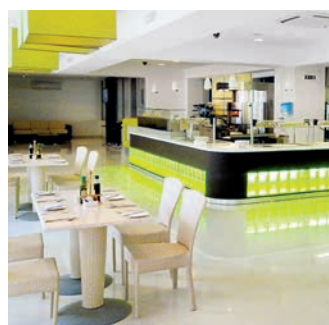
The hotel's restaurant