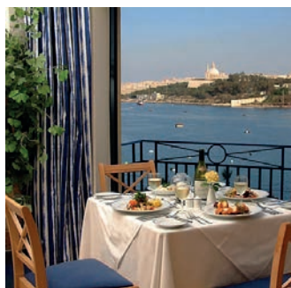
The Regatta restaurant