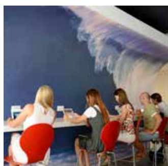
Students surfing the Internet

IELS Malta Institute of English Language Studies, Matthew Pulis St, Sliema SLM 3052, Malta