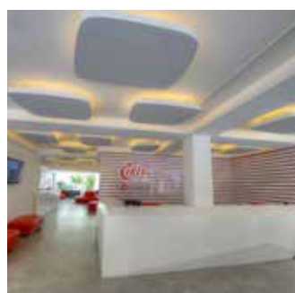
IELS Malta Reception