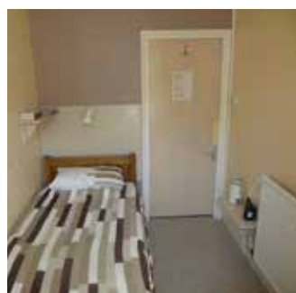
A single bedroom