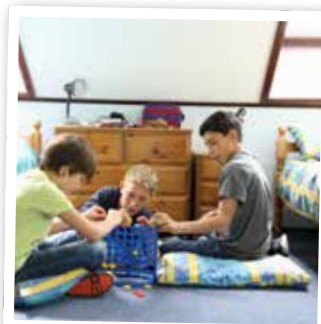
St Swithun's School