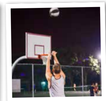
Lynn University has both indoor and outdoor basketball courts.